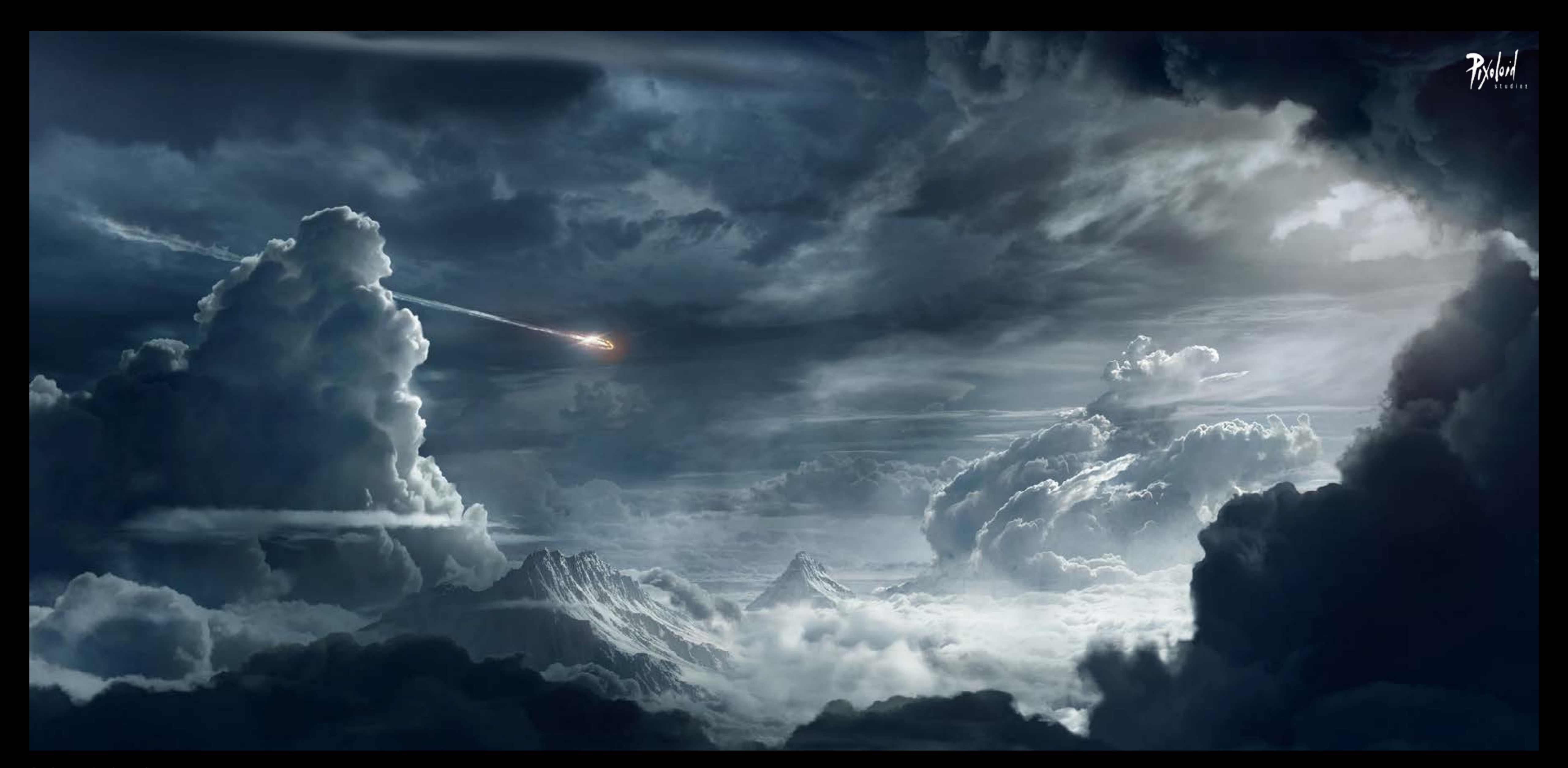
STORM CLOUDS Background Matte Painting for Balance Pilot, Client: Digital Hydra