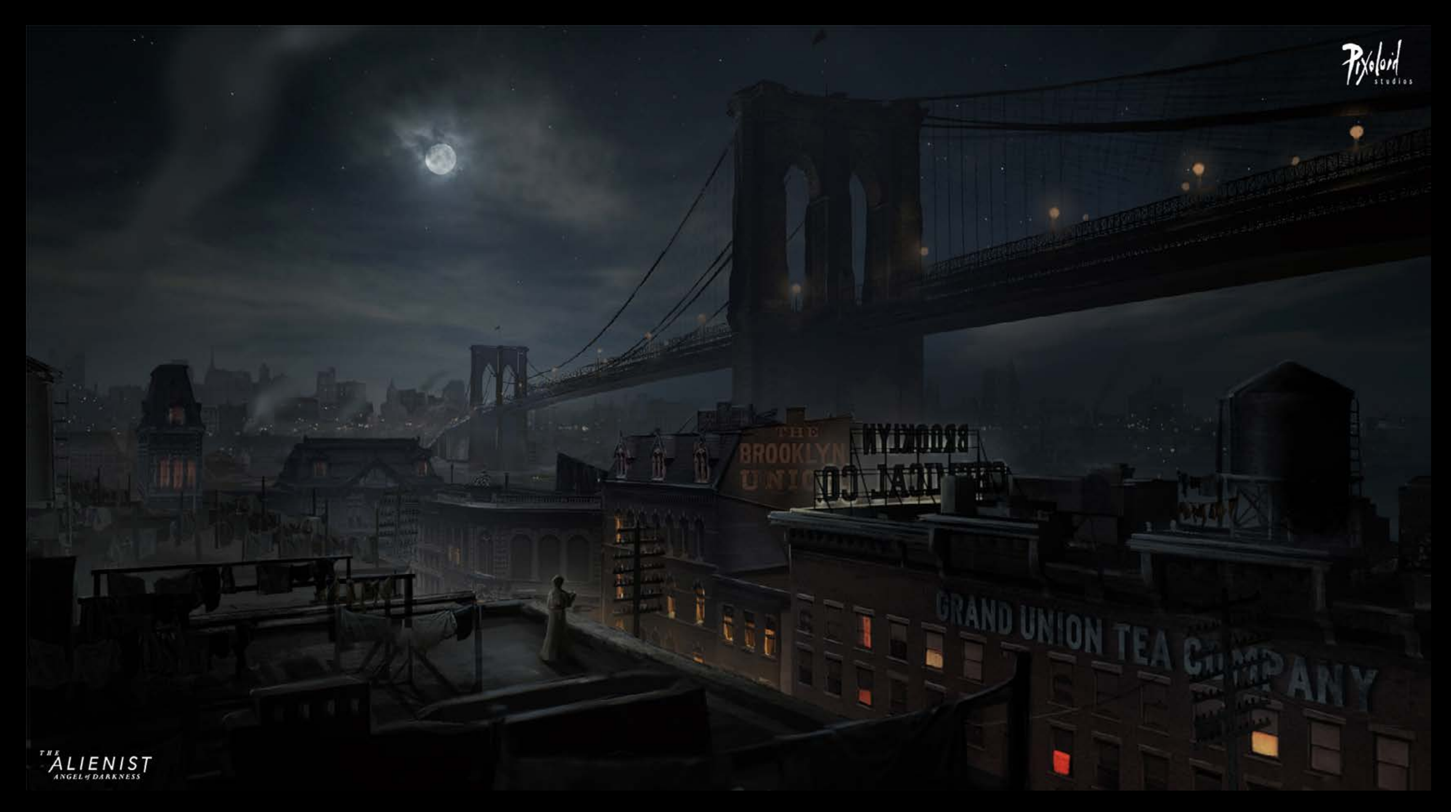
BROOKLYN BRIDGE 1896 Background Matte Painting for The Alienist - Angel of Darkness, Client: TNT