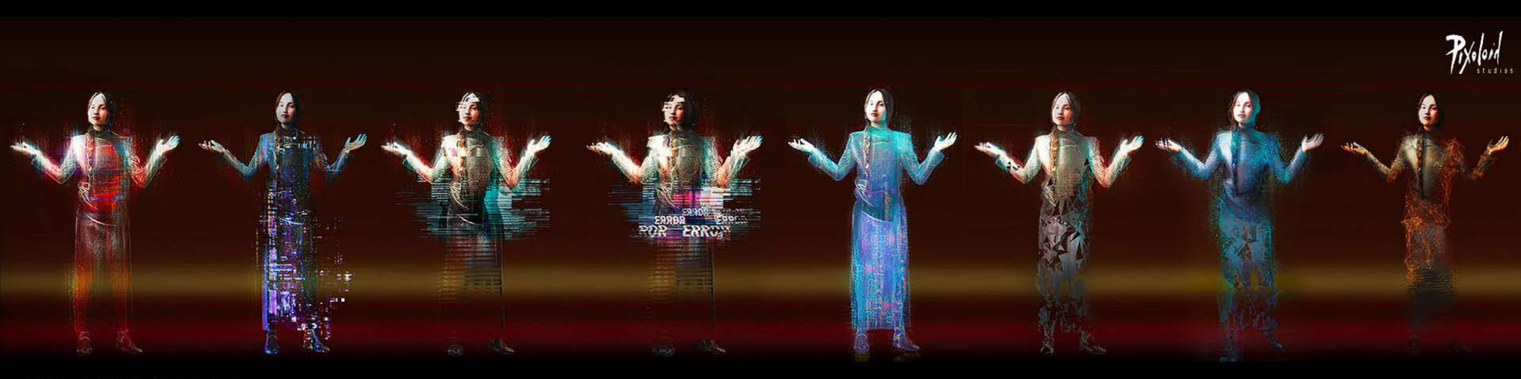
EXTRAPOLATIONS 2023