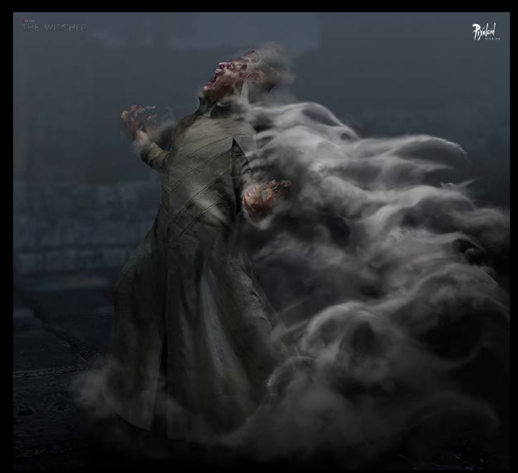
MAGE DISAPPEARING VFX concept variations for The Witcher, Client: Netflix